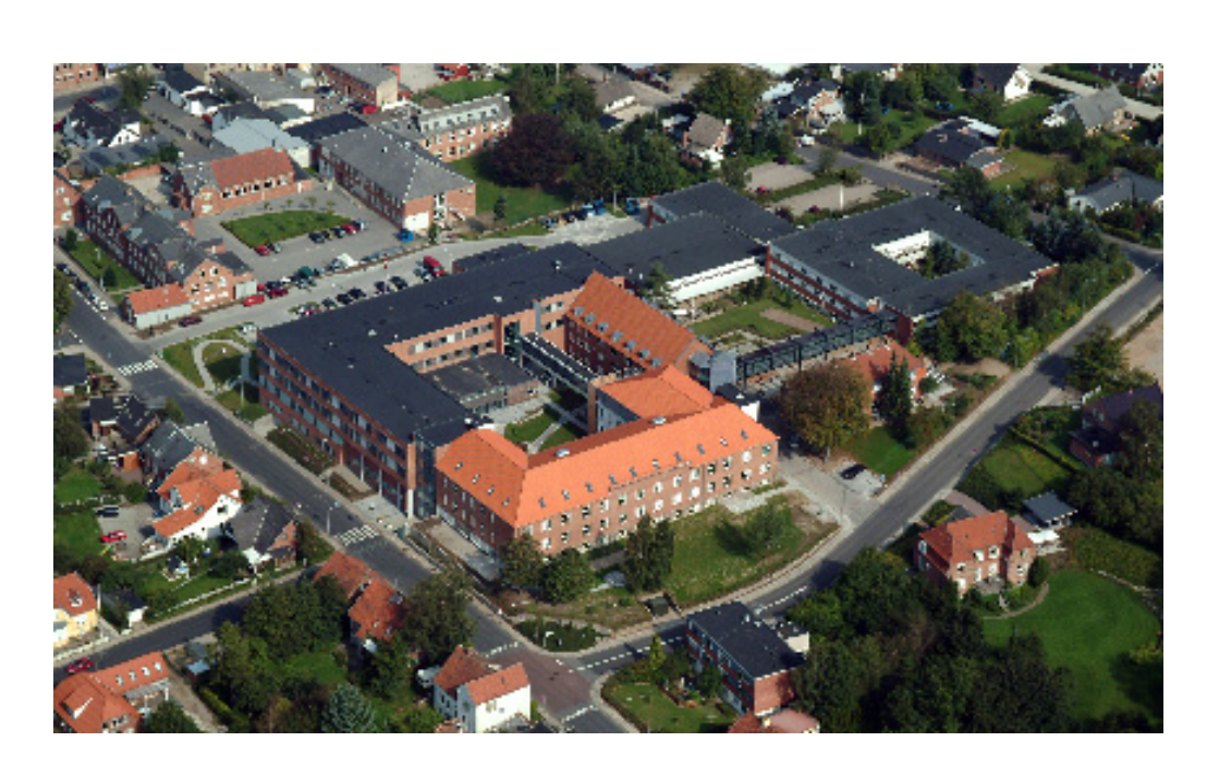
A specialised Neurorehabilitation Hospital in Denmark